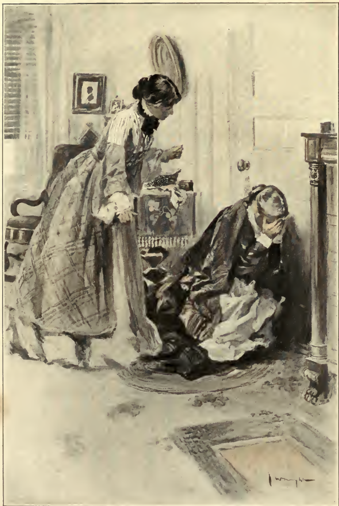
"It is not me," she moaned, "not me."